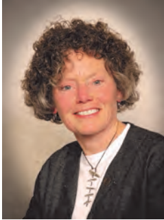
2011-2014 MCAH President

Welcome to another edition of MCAH news! We have much to offer as you read through the various articles which provide a deeper glimpse into how your association has been working for you to maintain market share, fair wage settlements, provide and assist with financing educational opportunities, social networking events and more. It has been a busy time and I encourage you to read the detailed articles in hope that they will provide you with feedback on your active association and further entice you to become engaged.