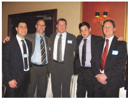
Management Group of Raymond James Ltd., and Levitt Safety | EHS Training & Consulting Services.

Associate Members showcase their goodwill by contributing 50% of revenue generated at their Annual Pub Night 50/50 Draw and Annual General Meeting Trade Show to our MCAH McMaster University Student Chapter. The Annual Christmas Party 50/50 Draw also boosts donations and revenue proceeds back to our future generation of industry leaders! Thank you 2012 and 2013 Pub Night Sponsors Stepright Capital Planning Inc., Levitt Safety | EHS Training & Consulting Services and Dew Point Insulation!