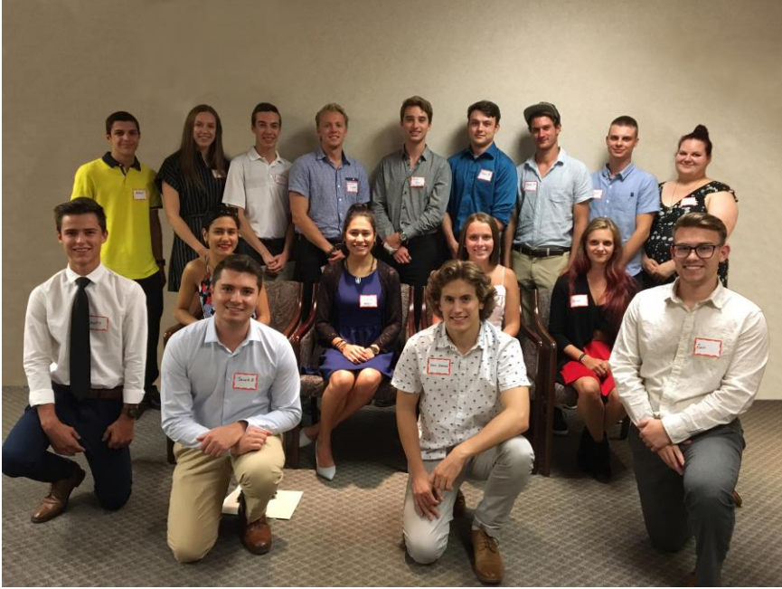
(Photo): Meet our 2018 Mechanical Contractors Association Hamilton Niagara Scholarship Awards Recipients

(October 25, 2018 SOUTHERN ONTARIO) – Employer company members of the Mechanical Contractors Association of Hamilton Niagara (MCAHN) introduce this year's student recipients of their 24 th Annual Scholarship Awards Ceremony. Since 1995, an education investment geared to support young professionals continues to generate significant interest within this southern Ontario unionized construction employer network, proudly serving Hamilton, Niagara, Halton, Brant, Haldimand and Norfolk Counties.